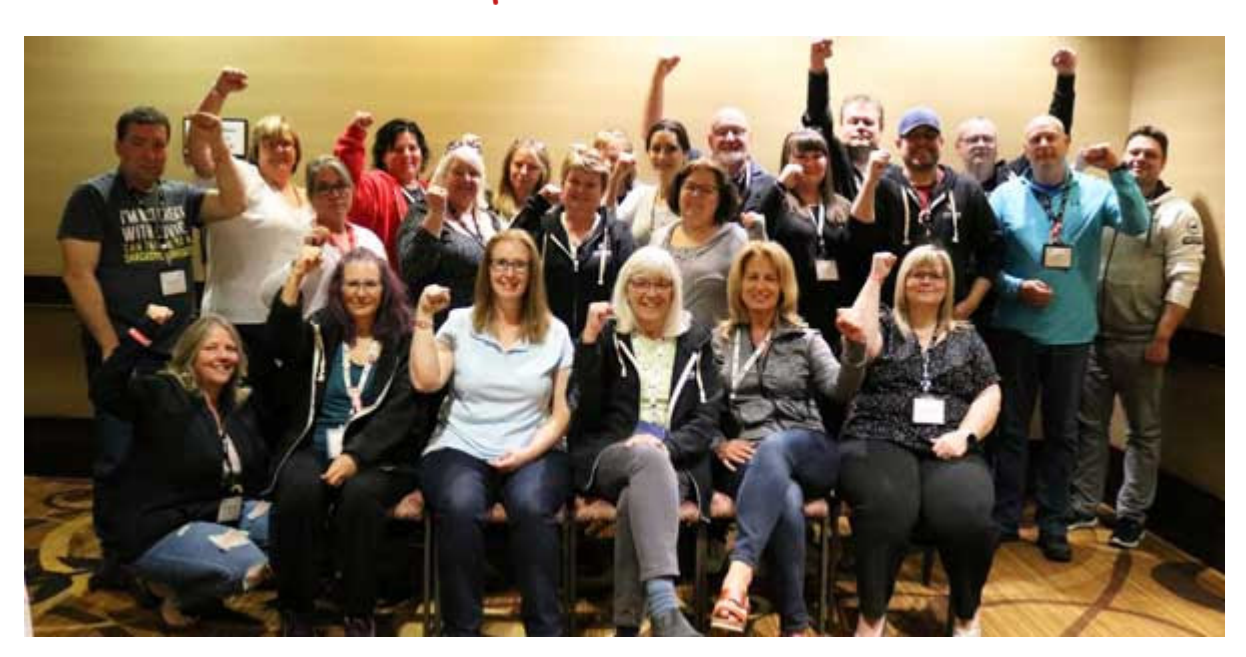
Through adversity and unprecedented challenges, Unifor solidarity continued to shine. Read about the exciting work in organizing, union-building, and policy-shaping that was shared at Atlantic Regional Council.